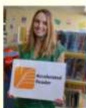
Year 8 Learning Café