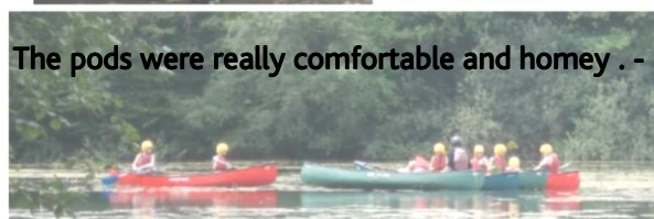
The pods were really comfortable and homey. – Eva