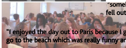
"I enjoyed the day out to Paris because I got to see the Eiffel Tower. I also got to go to the beach which was really funny and I had a great time."