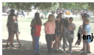
I enjoyed the paddle boarding and the trip to Paris.