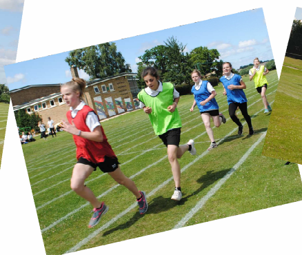
Photographs by Shaun Mulligan 7H2