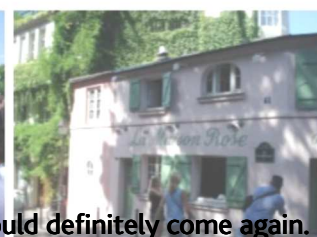
I loved France! It was amazing I loved the architecture, food and culture! I would definitely come again.