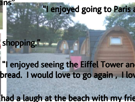
"I enjoyed seeing the Eiffel Tower and seeing how they make bread. I would love to go again, I loved the pods"