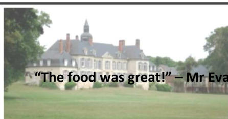
"The food was great!" – Mr Evans

Finally, on the fourth day, it was time to go home but we stopped at the bakery where we were shown how to make croissants and had to follow instructions in French.