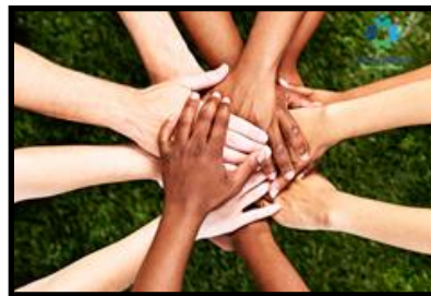
Equality & Diversity -