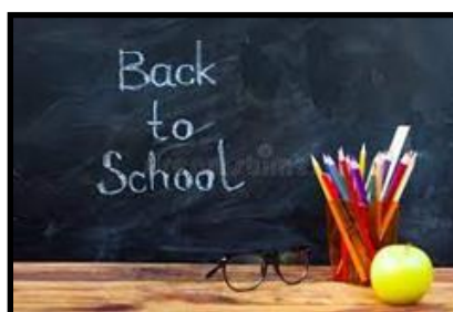
Embracing School Life -