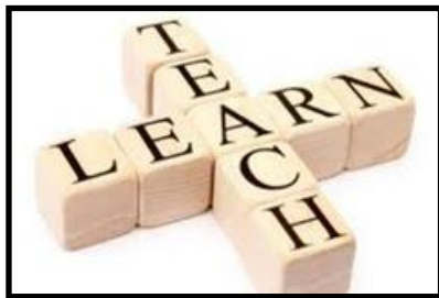
Teaching & Learning -

These are our 5 committees and their Year 7 representatives -