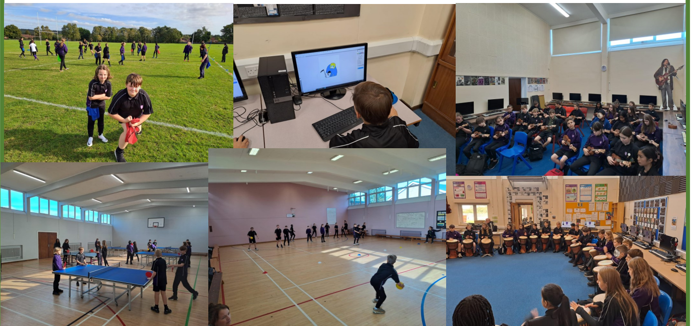
Table Tennis, Handball, Fitness, Digital Painting, Rugby, African Drums, Ukulele...

On Tuesday 17th October, Students enjoyed their first Super Learning Day. It was a chance for Year 7 to try 10 different actives, such as;