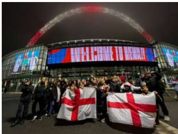
England Women's football trip to Wembley Stadium