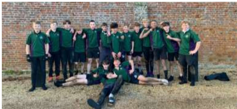
Y10 Rugby County Cup Championship day 5 TH Overall – well done everyone