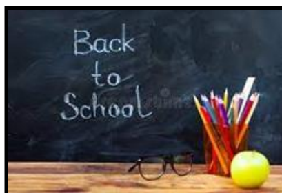
Embracing School Life -