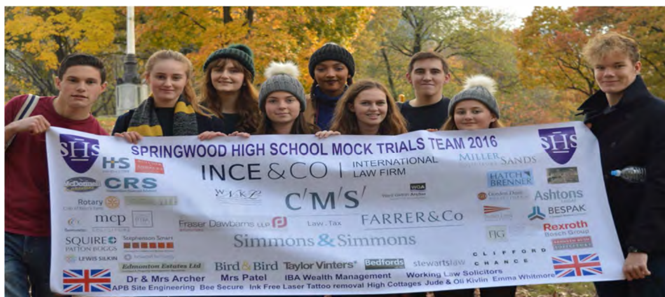
Springwood High School Mock Trials Team

This trip was like no other. It has given every member of our team so much. We have come back almost different people; more mature, more confident, more determined - the list could go on. This really has been the trip of a lifetime, and one that we will never ever forget.