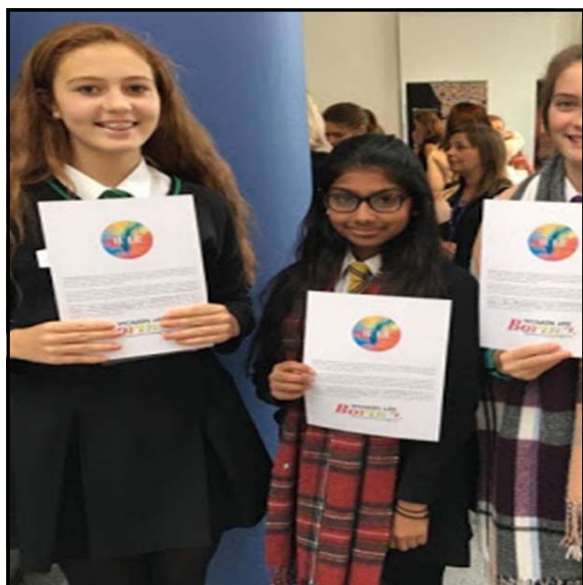
This is us having our picture taken for the Women are Boring blog