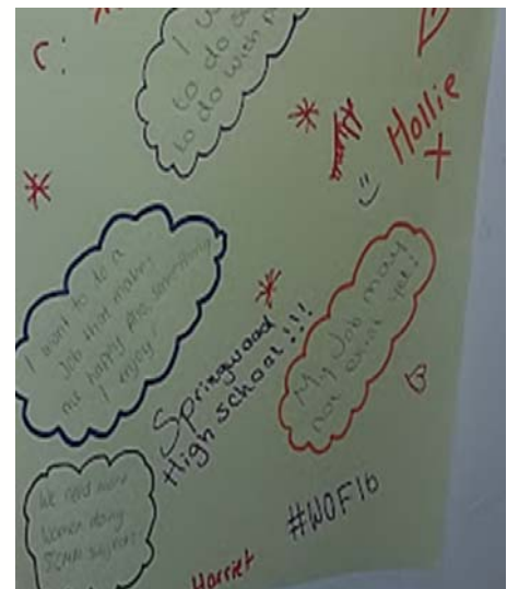
Poster that we made and stuck on the feedback wall