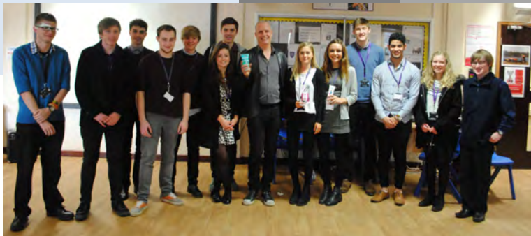
King of Shaves—Will King