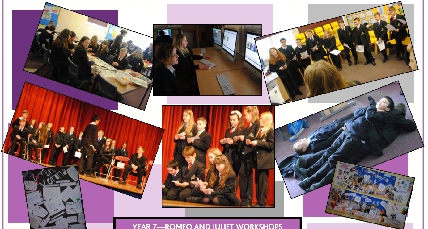
YEAR 7—ROMEO AND JULIET WORKSHOPS