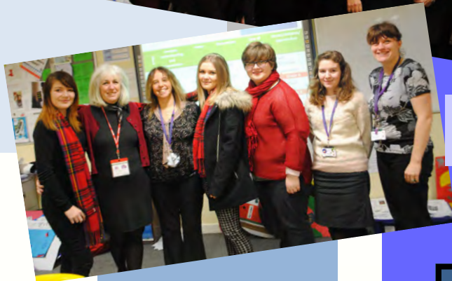
YEAR 12/13 INSPIRATIONAL SPEAKERS