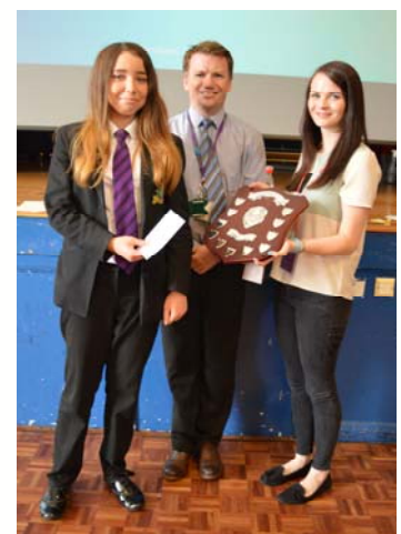
Endeavour Shield presented by Learning Resources