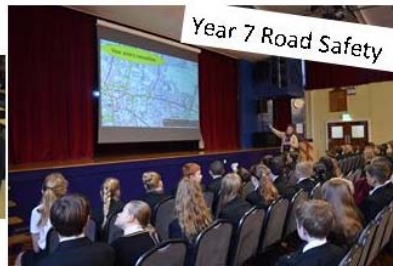
Year 7 Road Safety