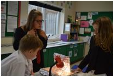
YEAR 8 SPACE