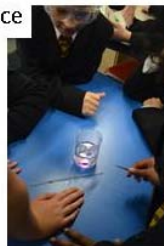
Year 9 IT