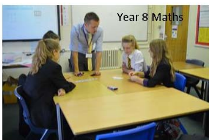
Year 8 Maths