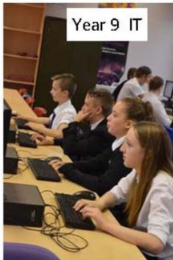
Year 9 IT

On Wednesday 7th October we put down our pens and used different ways of learning for No Pens Day. Each subject throughout the years supported the day by using various types of learning skills from art, using playing cards, using your own bodies to create well known land marks and various games incorporating Maths, English and History. Some watched films to gain knowledge while our Year 7s had a Road Safety presentation. There were lots of experiments taking place in the sciences and of course IT was a hit with all!! A successful day was had by all!