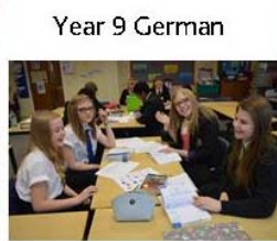
Year 9 German