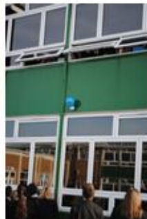
Year 7 Taster