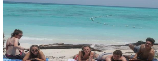
Okay and maybe we sunbathed a bit as well...

Finally there was Mantanani. We essentially lived on a beach, it was luxury! The sun rise was amazing, there was a lot to do and we even climbed coconut trees (which by the way are seriously difficult). It was also here that we got stuck in the craziest thunder storm I've ever seen in my life, it rained for a good day. The locals here were so nice and were always friendly, even if they couldn't speak English. It was such a nice end to the trip and such a nice place where we could reflect on everything that we had been through.