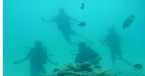
Here is me and my group on the 18 metre dive and that's a sea